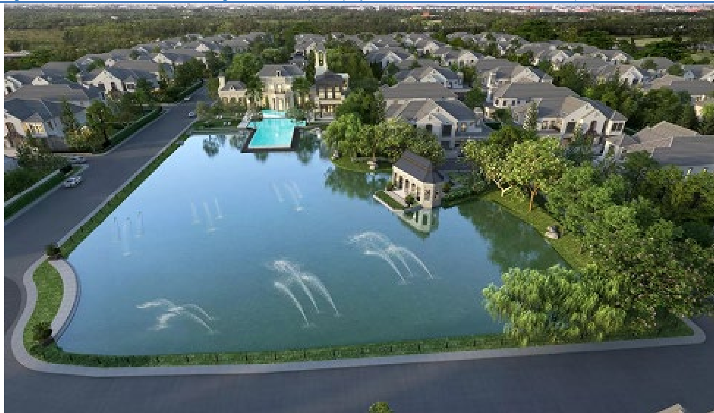
Figure 2: An aerial view of Nantawan Bangna km 15 luxury SDH project, which was launched in mid-February